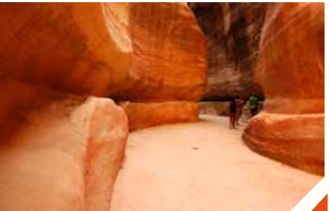
Al Siq – the entrance to Petra

spectacular view of Jericho, the Jordan Valley and the Dead Sea. This is where it is believed Moses saw the Promised Land. At Madaba, [biblical Medeba] is the well preserved ancient mosaic map of the Holy Land. Travel south on the biblical King's Highway for a short stop at the nearby mountain palace of Herod Antipas where tradition says St John 'The Baptist' was beheaded.