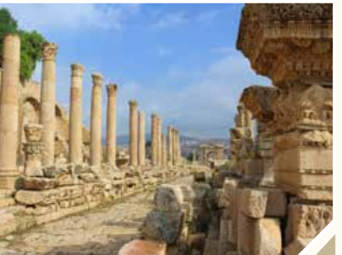
Roman Amphitheatre - Jerash

An early departure to the Border at Sheikh Hussein Bridge, where we enter the Hashemite Kingdom of Jordan. Visit Pella where the Jerusalem Church fled to in 65 A.D. Continue to the ancient ruins of Gadara and from there to Jerash [Gerasa of Roman times], one of the best-preserved and most complete provincial Roman cities. Well-known monuments include the colonnaded street, the Temple of Zeus, the theatre, the forum and Hadrian's Arch. The journey continues through an area once settled by the ancient Ammonite and Amorites to our hotel by the Dead Sea.