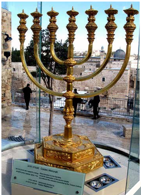
24 Carat Golden Menorah

At the Archaeological Park we see a film [original 2nd Temple stones and southern steps that Jesus walked on]. At the Jewish Quarter, see the gold Menorah built for the next [3rd] Temple, the Burnt House and the Roman Cardo. The rest of the day is at Mt Zion, David's Tomb and citadel for views of Old Jerusalem.