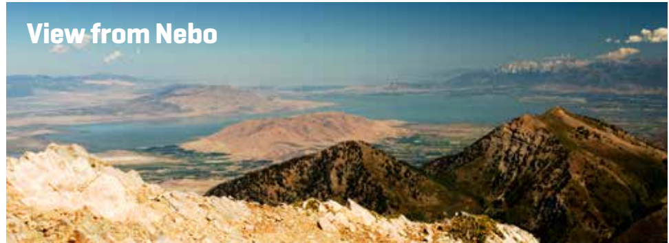
View from Nebo

Note Pukekohe Travel / MIR Pilgrimages reserves the right to correct errors and omissions contained within this brochure without recourse.