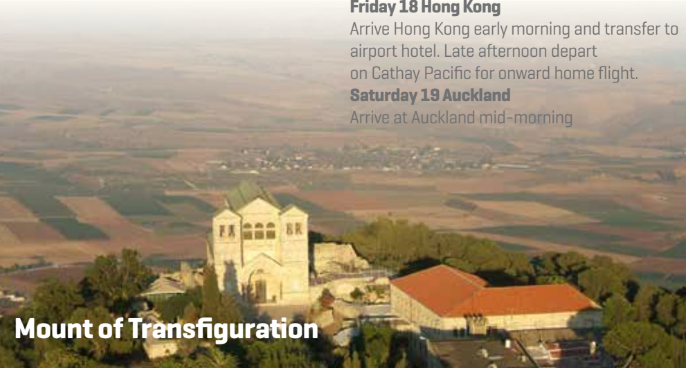
Mount of Transfiguration

Saturday 19 Auckland Arrive at Auckland mid-morning